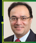
Muhammad Aurangzeb President HBL