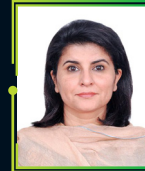
H.E. Amna Baloch Pakistan High Commissioner to Kuala Lumpur Republic of Pakistan in Malaysia