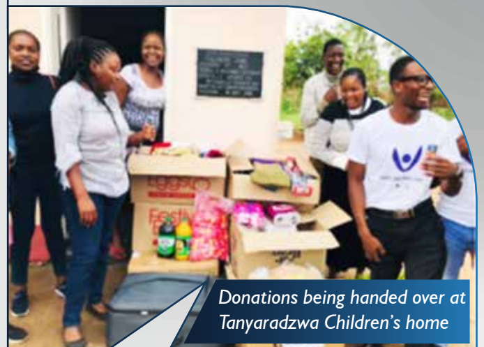
Donations being handed over at Tanyaradzwa Children's home

In addition, I am also a member of University of Zimbabwe Community Outreach whereby we aim to help our brothers and sisters who are underprivileged by providing them with things such as clothes, food and stationery.