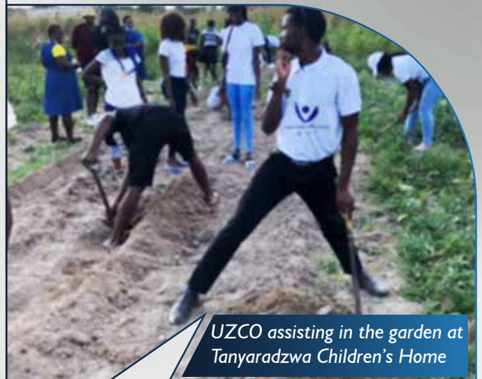
UZCO assisting in the garden at Tanyaradzwa Children's Home

As UZCO we also empower the youth by teaching them on health and awareness. The youth is taught on issues such as sexually transmitted ailments, chronic diseases and we also leadership seminars. In conclusion, our main mandate is to touch as many lives as possible.